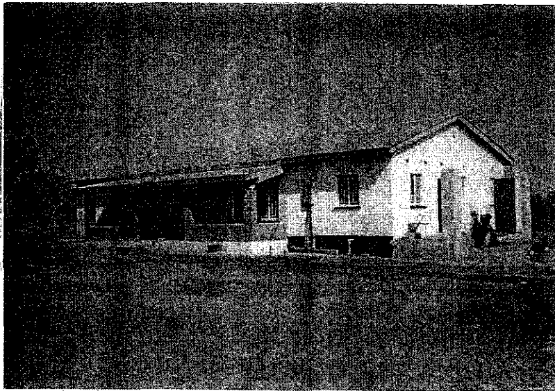
Our first house, front view

In the U.S. we blame the increase in the cost of gasoline on China, which is not the problem in Zambia where we have always paid $4.00 to $5.00 a gallon. In Zambia, the problem is China's building boom has doubled the cost of cement in the past year. Now that we have the walls built for the second house and the storage building, we need to find enough money to put on roofs (which will cost about $2,500 each), plaster the walls and complete the construction of both buildings (another $4,000 each) before the rainy season starts at the end of October.