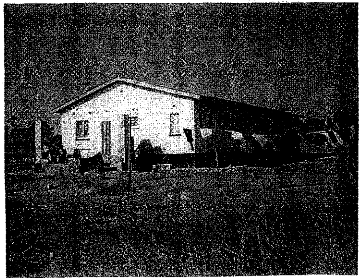
Back of the house