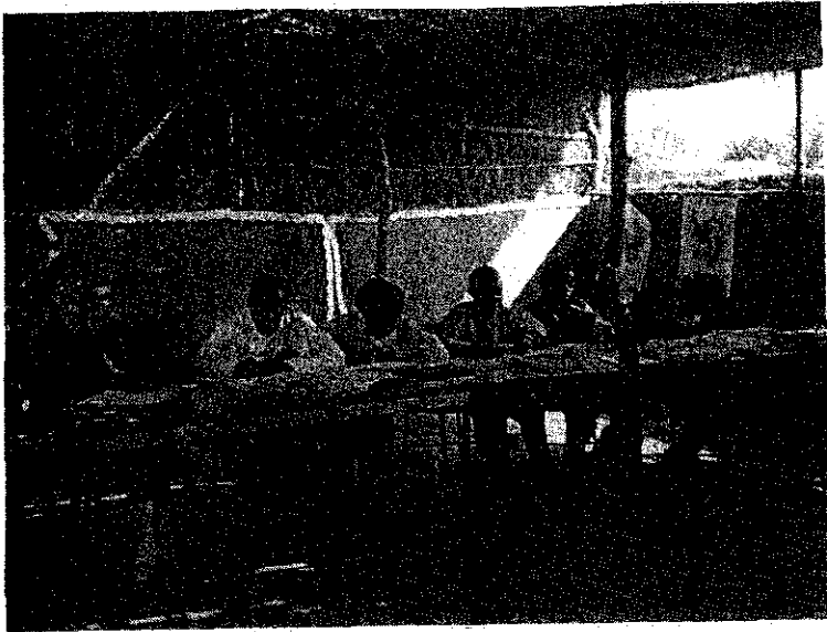
7 th grade class

Once everyone moved into our new house, we had to find space to keep our school going so the children don't get behind in their studies. In May, we built two classrooms made of thatched grass where we are holding our 3 rd and 7 th grade classes. It is very important our 7 th graders keep up with their studies because in November they will take a national exam to see if they qualify to go on to 8 th grade and secondary school.